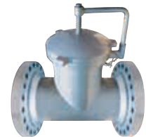
Model 91 T-type strainer

“Money can’t buy you happiness...But it does bring you a more pleasant form of misery.”