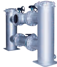
Model 950B duplex offset strainer (BC/QOC)