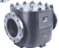
Model 510 simplex strainer