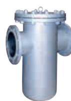
Model 90 simplex strainer