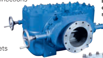
Model 570 duplex strainer